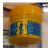
36. Vandevi (Kinjin)