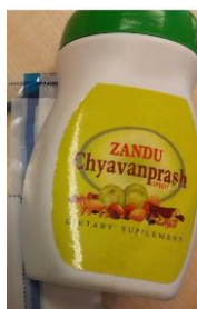
53. Chyavanprash (Zandu)