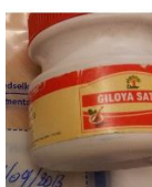
29. Giloya satva (Dabur)