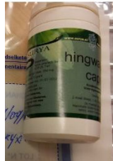
9. Hingwastak caps van Surya