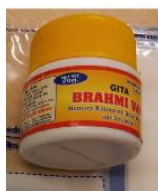
27. Brahmi vati (Gita)