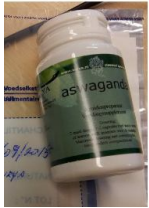
2. Ashvagandha van Surya