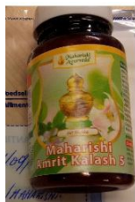
41. Maharishi amrit kalash 5 (Maharishi)