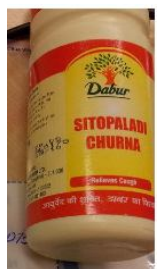
26. Sitopaladi churna (Dabur)