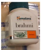
5. Brahmi van Himalaya