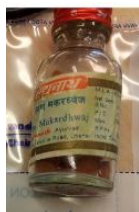
51. Swarna Makardhwaj (Baidyanath)