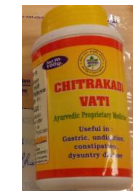
18. Chitrakadi vati (Gita bhawan)