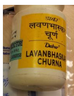
31. Lavanbhaskar churna (Dabur)