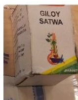
23. Giloy satwa (Baidyanath)