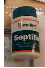
15. Septilin (Himalaya)