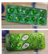
43. Pudina hara (Dabur)