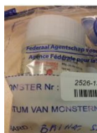
33. Brihat Shankh vati (Unjha)