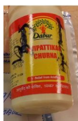
25. Avipattikar churna (Dabur)