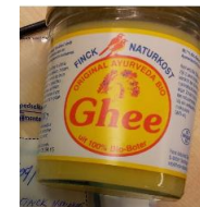
56. Ghee bio-boter (Finck naturkost)