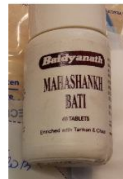
37. Mahashank bati (Baidyanath)