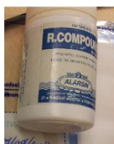
32. R. Compound (Alarsin)