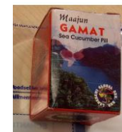
57. Gamat (Rojam industries)