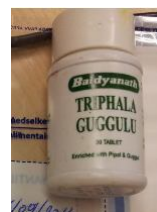
39. Triphala guggulu (Baidyanath)