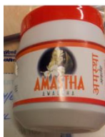
28. Amastha (mpil) 250 g