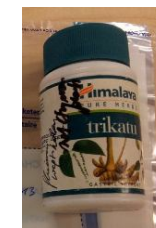
19. Trikatu (Himalaya)