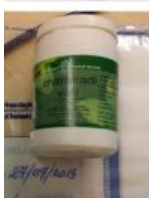
6. Chitrakadi vati