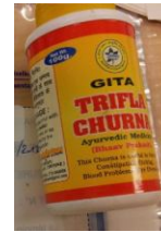
16. Trifla Churna (Gita)