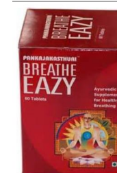
58. Breathe Eazy (Pankajakasthuri)