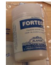
17. Fortege alarsin