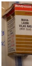
50. Mahalaxmi vilas ras (Baidyanath)