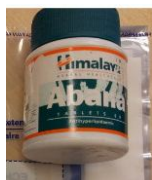
46. Abana (Himalaya)