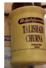
40. Talishadi churna (Baidyanath)