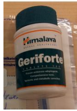
8. Geriforte van Himalaya