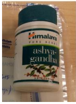
1. Aswaganda van Himalaya