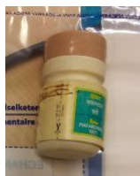
49. Makardhwaj vati (Dabur)