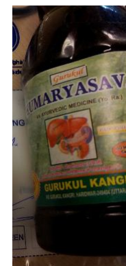
55. Kumaryasava (Gurukul)