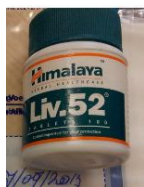
45. Liv. 52