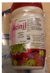
52. Acinil (Dabur)