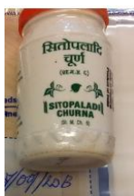
30. Sitopaladi churna (Zandu)