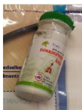
48. Shwaskuthar rasa (Unjha ayurvedic)