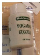
14. Yogaraj guggulu (Baidyanath)