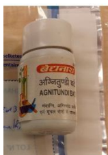
22. Agnitundi Bati (Baidyanath)