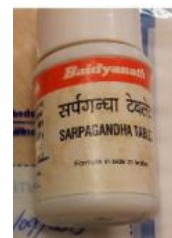
38. Sarpagandha (Baidyanath)