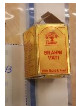
4. Brahmi Vati van Dabur