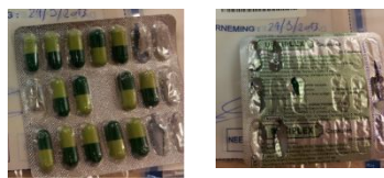
12. Urtiplex capsules